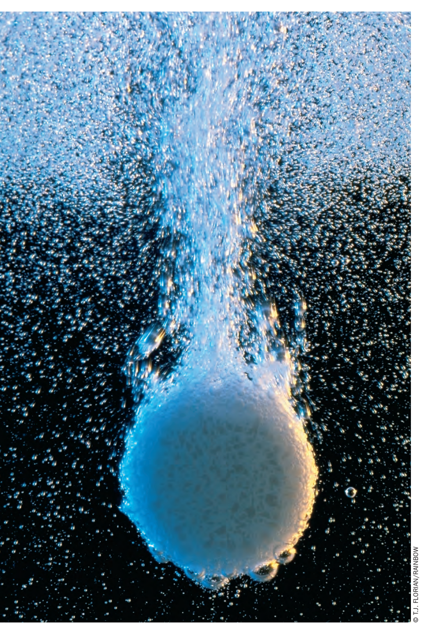
In this lesson, you will study what happens to the mass of reactants and products in this chemical reaction.