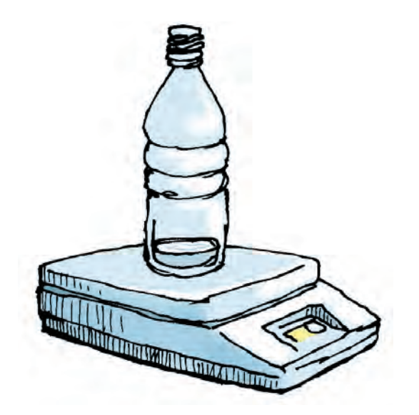
Figure 25.2 After the reaction has stopped, measure the mass of the bottle, its cap, and its contents, keeping the cap tightly sealed.