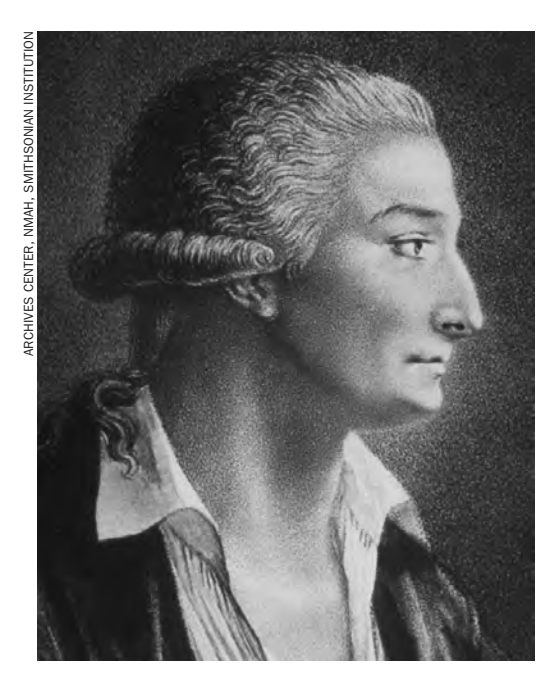
Antoine Lavoisier (1743–1794) was one of the founders of modern chemistry.

Matter may change from one form into another. For example, when the water in the bowl absorbs energy from the sun and evaporates, it becomes water vapor in the atmosphere. The piece of paper gives off heat and light energy as it burns, and the matter in it is converted into carbon dioxide, water vapor, and other gases that escape into the atmosphere. Some of the mass will remain behind as ash. In both cases, the matter changes its form, but its total mass stays the same. The same mass of each element is present before