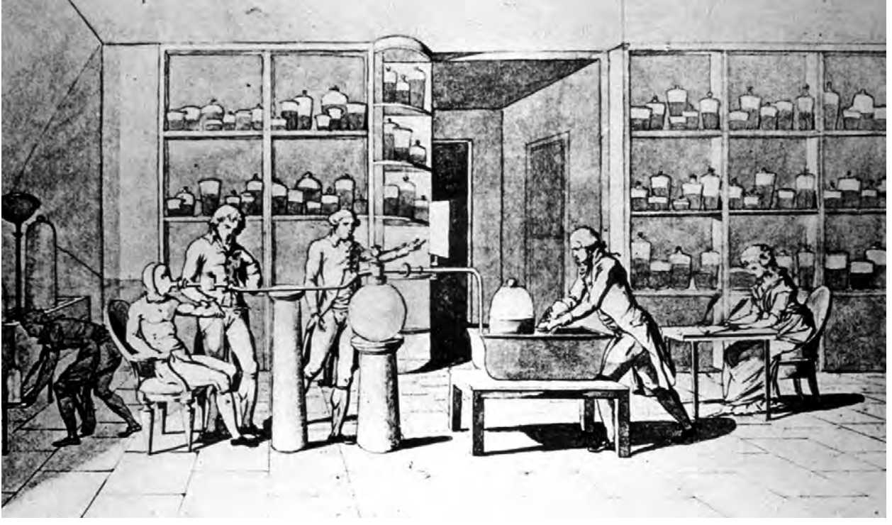
Antoine Lavoisier was particularly interested in the chemistry of gases. This picture shows him working with other scientists on an investigation of the gases exchanged during breathing.

Imagine you are Antoine Lavoisier. How could you design an experiment to investigate what happens to the total mass of matter when a caterpillar eats a leaf? Draw a picture of the apparatus you would use and write a short description of the procedure you would follow. Remember that Antoine Lavoisier did not have electronic balances.