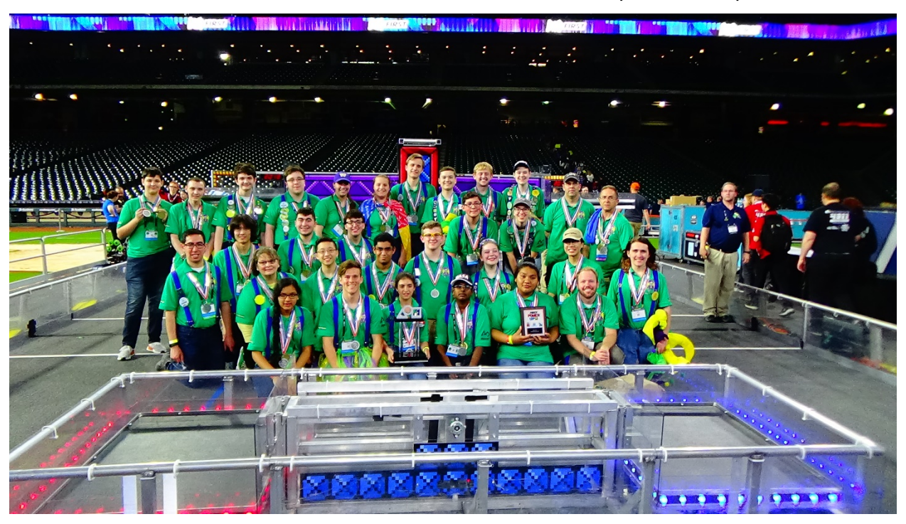
Jack in the Bot robotics team proudly poses after placing second in the world championship

The George R. Brown Convention Center was rocking with excitement April 18 to 21 as more than 15,000 finalists from around the world traveled to Houston, Texas and put their innovation skills to the test at the annual <u>FIRST® Robotics Competition</u>. The four-day event, attended by 30,000 participants and fans, came down to a heart-pounding conclusion Saturday night in front of thousands of cheering fans when teams competed in match finals for the world championship!